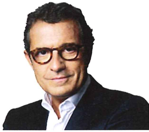
António Luis Guerra Nunes Mexia