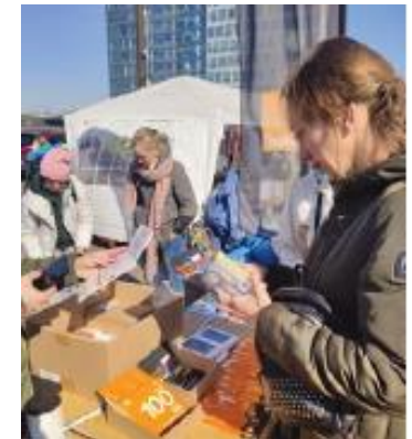
Fig 29 Support for the Ukrainian population: delivery of powerbanks at the border with Poland