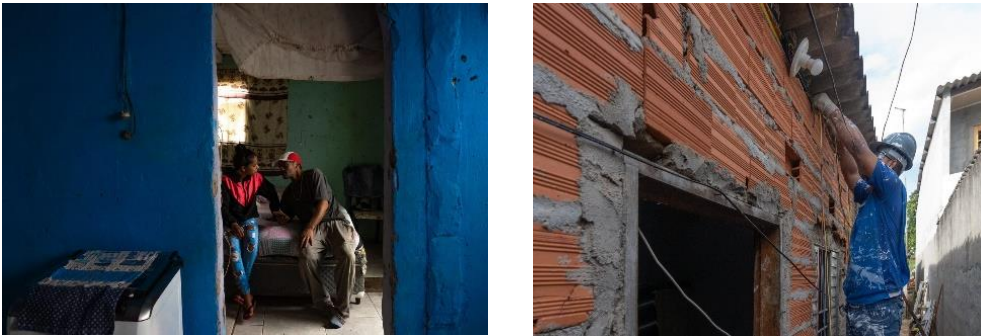
Fig 7 and 8 Project Energy Inclusion in Bambi neighborhood, Guarulhos, Brazil

EDP Renewables also establishes collaboration agreements with local authorities and suppliers, meeting the needs of disadvantaged families in communities near wind farms, including access to thermal comfort, electricity or running water, or even the complete rehabilitation/reconstruction of their homes. Since its creation, this program has helped families in several countries where EDP is present, including Spain, Portugal, Brazil, Romania, Poland, and Mexico.