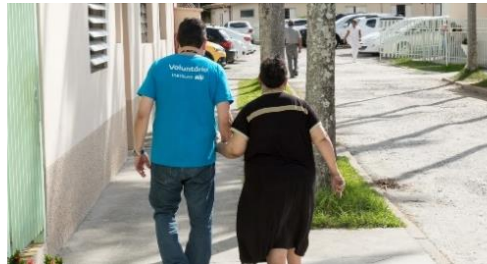
Fig 27 EDP employee participating in a volunteering action in the community

Sports are a vital part of a healthy lifestyle and promote teamwork and leadership skills, while also serving as a tool for social inclusion. For this reason, EDP supports various projects related to sports as a means of inclusion in several countries where it operates. Additionally, EDP invests in the recovery and updating of the necessary infrastructure and equipment for sports practice, enabling local communities to enjoy the benefits of sports.