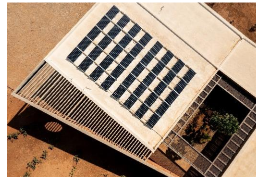
Fig 3 and 4 Aerial view of Girl Move Academy, Nampula, Mozambique

Also, get to know how the A2E Fund impacts the lives of these people at: A2E Fund: first-person stories and Mozambique: the power of the sun | edp.com