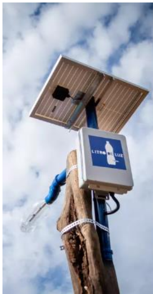
Fig 5 and 6 Project Liter of Light, Brazil