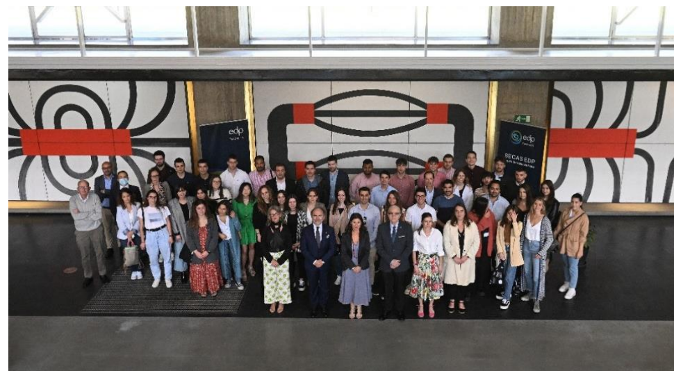
Fig 14 Becas Académicas EDP – students at the Hydroelectric Plant in Proaza, Asturias, Spain

person and online, providing them with the necessary tools to do so. Since its implementation 39 years ago, dozens of scholarship holders who participated in this program have joined the EDP group in Spain, which gives a special incentive to this program. Find out more: EDP YES/Becas Académicas