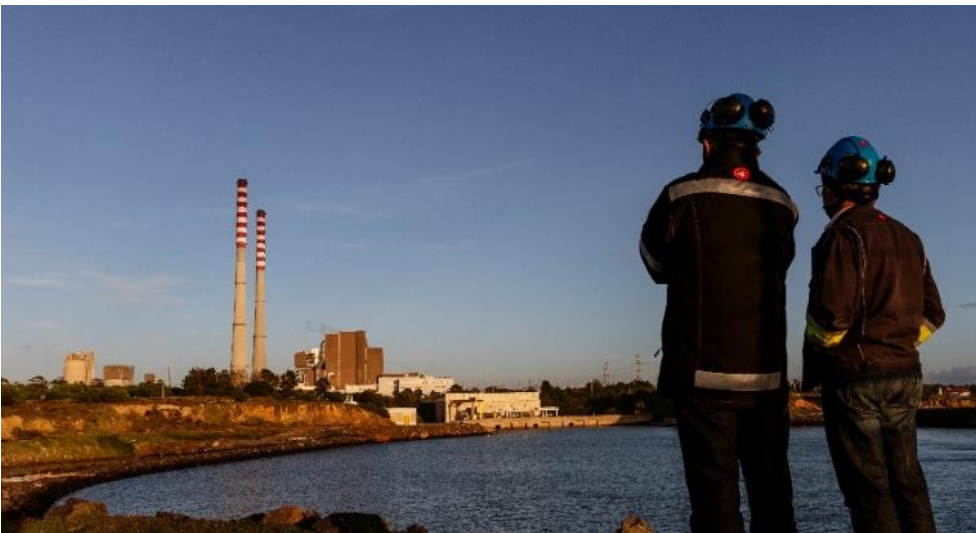
Fig 16 View of the Sines thermoelectric plant, now deactivated, Sines, Portugal

capacity building for entrepreneurs and the provision of specialized consulting services. In addition to capacitating the entrepreneur, the program enables the structuring of the business idea, defining the business plan, anticipating legal difficulties and other necessary formalities to form a company. In this program, 40 candidates received training with 17 business ideas, with 9 small businesses being developed that have the potential to create 21 jobs. Learn more at: EDP YES/NAU . Due to its importance for local communities in the context of a Just Energy Transition, the Sines Active Future program was included by the World Economic Forum in its Toolkit From Coal to Renewables and presented in Davos, Switzerland, where it won the " Community Involvement Program of the Year " award given by Environmental Finance at the Sustainable Company Awards 2022