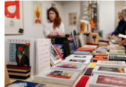
Fig 20 "Electra" magazine

awarded for her renewed approach to painting and its extension into the field of objects, combining irony and humor with institutional criticism.