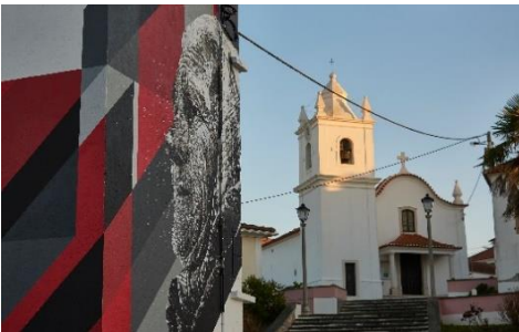
Fig 22 Public Art Program: UniArt project, Ribatejo, Portugal

In the first edition, launched in 2020, in collaboration with the Municipality of Ribera de Arriba (Central Soto – a municipality covered by the Just Energy Transition), three locations were identified for the implementation of the project, and two of them – an exhibition and performance space in the Bueño parish and the revitalization of the La Llosa neighborhood in Ferreros for the social integration of vulnerable people – will be inaugurated in September 2023.