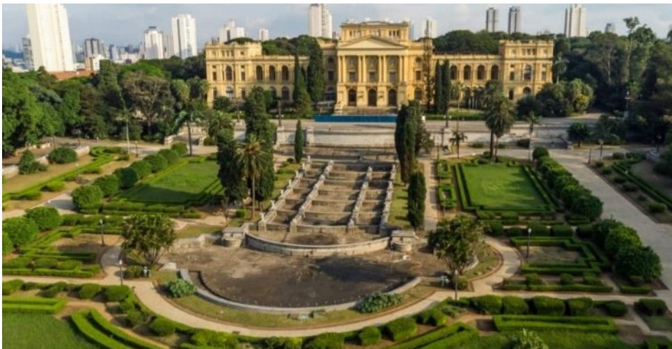
Fig 26 Ipiranga Museum, São Paulo, Brazil

In Portugal, the Traditions program stands out as a biennial initiative that provides financial and skills training for projects aimed at valuing and preserving regional or local traditions in Portugal. From gastronomy to crafts, including sayings, beliefs, instruments, dances, and songs, there are various traditions that can inspire projects. The program currently covers 81 municipalities, corresponding to the areas where the six EDP power production centers (hydroelectric and thermal power plants) operate: Tejo Mondego, Douro, Cávado Lima, Ribatejo, Lares, and Sines.