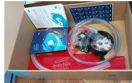
Fig 12. Kit for the hydro power plant of the "Learn with Energy" project

In Portugal, through the Learn with Energy project, elementary school teachers and students have the opportunity to deepen topics such as various renewable energies, sustainability, among others, and to assemble a reduced-scale model of a turbine and a hydroelectric power plant in the classroom to understand their operation. Thanks to these initiatives, many children have had the opportunity to learn how energy is generated, helping to educate future generations about the benefits of renewable energies. Find out more about this project at: EDP-YES/Learn with Energy