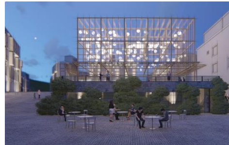
Fig 25. Public art program: "Luz Minera" project, Tineo, Asturias, Spain

In 2022, a new edition was launched in collaboration with the Municipality of Tineo, in Asturias, and the "Luz Minera" project was chosen – a project for the central square of the city that evokes a mining lamp with light modular structures – designed by two students from the Oviedo School of Art, to be implemented next year. Thus, EDP reinforces its position and commitment to sustainability and innovation, stimulating creativity and new ideas for the transformation of public space based on sustainable urbanism.