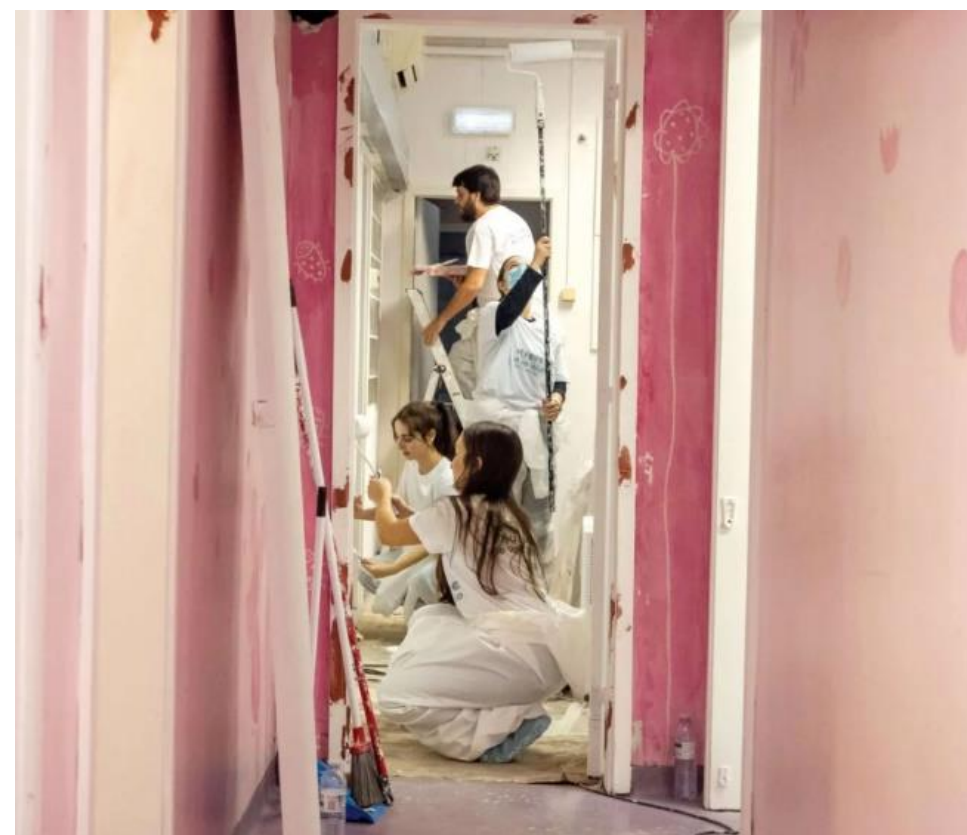
Fig 1 EDP volunteers in action