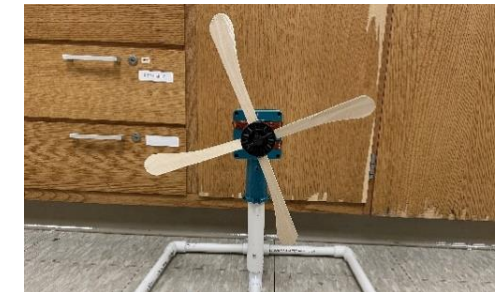
Fig 13 Wind turbine assembled by students in the KidWind challenge

World Wind Day is celebrated on June 15th in over 75 countries to raise awareness about the potential of wind power to improve our lives while contributing to a sustainable future. EDP marks this date annually with an open house event at a wind farm, inviting local school children and the community to participate in various activities such as contests, games, or explanations of how the wind farm operates. In addition to World Wind Day, EDP promotes more visits to wind farms throughout the year . These actions serve to educate future generations and local communities about the importance of renewable energies while strengthening the positive relationship between the communities and the company.