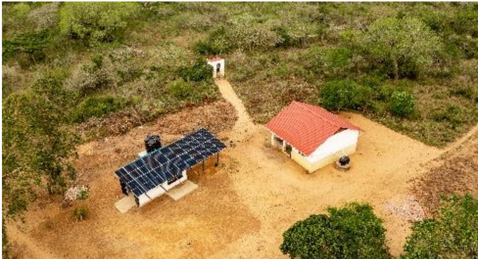
Fig 2. Aerial view of the project Viva con Agua, Hindane, Mozambique

In 2022, the 4th edition of the A2E Fund took place, targeting projects in Mozambique, Malawi, Nigeria, and Angola. In this edition, EDP supported 9 community clean energy projects in these countries, with an investment of 1 million euros. From installing solar panels to using refrigeration systems powered by renewable energy, the projects share the goal of improving the lives of communities – it is estimated that the supported initiatives will benefit over 900,000 people directly and indirectly in the four countries.