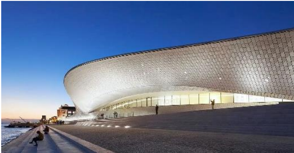
Fig 19 Exterior view of MAAT – Museum of Art, Architecture and Technology, Lisbon, Portugal

EDP offers a cultural boost to the city of Lisbon through the MAAT – Museum of Art, Architecture and Technology – by presenting national and international exhibitions with the contributions of contemporary artists, architects and thinkers. This museum also houses the EDP Foundation Art Collection. Inaugurated in October 2016 and located on the riverside of the historic area of Belém in Lisbon, the EDP Foundation campus covers an area of 38,000 square meters that includes a converted thermal power plant – the Central Tejo, an emblematic building of industrial architecture built in 1908 – and a new building designed by the London-based architectural studio AL_A (Amanda Levete Architects). Both buildings host exhibitions and events programmed by the museum and are connected by a garden designed by the Lebanese landscape architect Vladimir Djurovic. Learn more at: EDP YES/MAAT