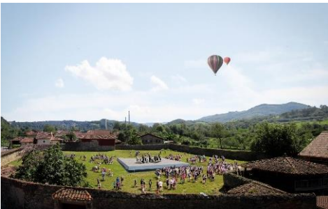
Fig 24. Public Art Program: project for an exhibition and performance space, Bueño, Asturias, Spain