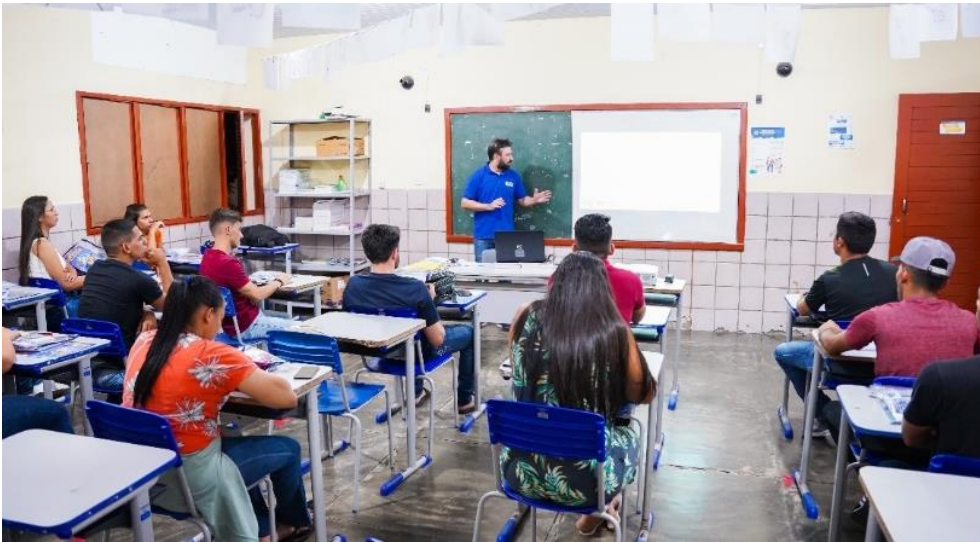
Fig 15 Students at a Keep it Local training session, Brazil

In Brazil, the 1st edition offered 25 scholarships for the Photovoltaic Systems Installer course, taught by SENAI, the largest vocational education complex in Latin America. This course took place in the municipality of Lajes, in the state of Rio Grande do Norte – one of EDP's main investment centers in Brazil and also a hub for investments in the sector in the country. In total, 21 students completed the course and were trained to work professionally in the region, without the need to travel to other cities in search of job opportunities. In the 2nd edition, this time for training in the wind energy field, the program took place in the municipality of Caiçara do Rio do Vento, also in the state of Rio Grande do Norte. It is also a region with numerous wind projects by various companies and high demand for skilled labor. In total, 26 candidates received scholarships for the qualification course in Installation, Operation and Maintenance of Wind Energy Generation Systems.