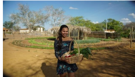
Fig 17 EDPR Rural program in Brazil

new technologies. Since the creation of this program, EDP has contributed over 6 million Brazilian real to the development of this project in this country, benefiting 26 communities and directly impacting 826 local producers. In parallel, the program has promoted female empowerment in a context where women are already the majority in rural work. Find out more about this project at: EDP YES/EDPR Rural