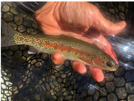
Fig 9 Release of a rainbow trout in its natural environment

FundaciónOSO de Asturias , a private nonprofit organization whose goal is to promote activities aimed at the conservation and scientific research of the brown bear populations in Cantabria and their habitat. In 2022, with the support of EDP, they developed an information program for visitors to protected natural areas where there is a consolidated population of bears – Environmental Informants – which contributes to raising awareness among people about the importance of respecting, improving, and recovering the environment where this species lives.