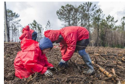
Fig 10. EDP volunteers in a reforestation action

In this country, EDP also supported the initiative " Em Defesa dos Oceanos " (In Defense of Oceans), which aimed to unite the largest number of divers in an underwater cleaning action in Sesimbra, in an attempt to break the Guinness World Record, demonstrating that it is possible to bring people together for an environmental cause and that marine waste can have a second life beyond the landfill as a final destination. This initiative promoted by the Oceanum Liberandum association, in partnership with the Municipality of Sesimbra, aimed to reinforce the importance of actions to protect marine life and combat climate change. In addition to the approximately 597 divers involved (who managed to break the Guinness record), EDP volunteers also participated, helping to carry part of the approximately 3,500 kg of marine waste litter removed from the ocean.