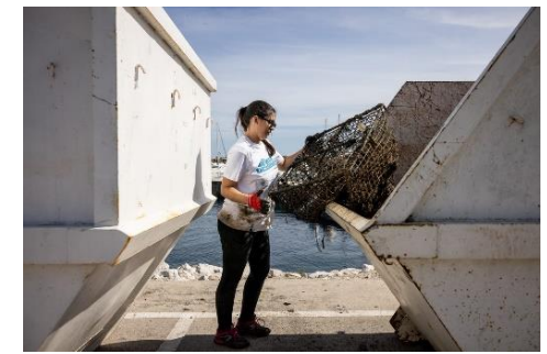
Fig 11. EDP volunteer in the "Em Defesa dos Oceanos" project