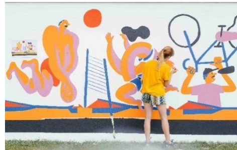
Fig 23 Public Art Program: ENERGIZARTE project, Minho, Portugal