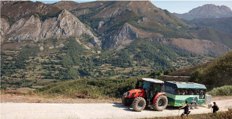
Fig18 ENTAMA: "Tourist train of Brañagallones" project, Caso, Asturias, Spain

Through this initiative, EDP intends to strengthen its social and economic involvement with the local communities near its production centers. In the first 3 editions, Entama supported 25 projects that generated more than 50 jobs. In the current edition (4th edition), Entama will reach 500 thousand euros of investment and the social role of the project has been reinforced, prioritizing aspects such as support for women's entrepreneurship. Find out more about this program at: EDP YES/ENTAMA .