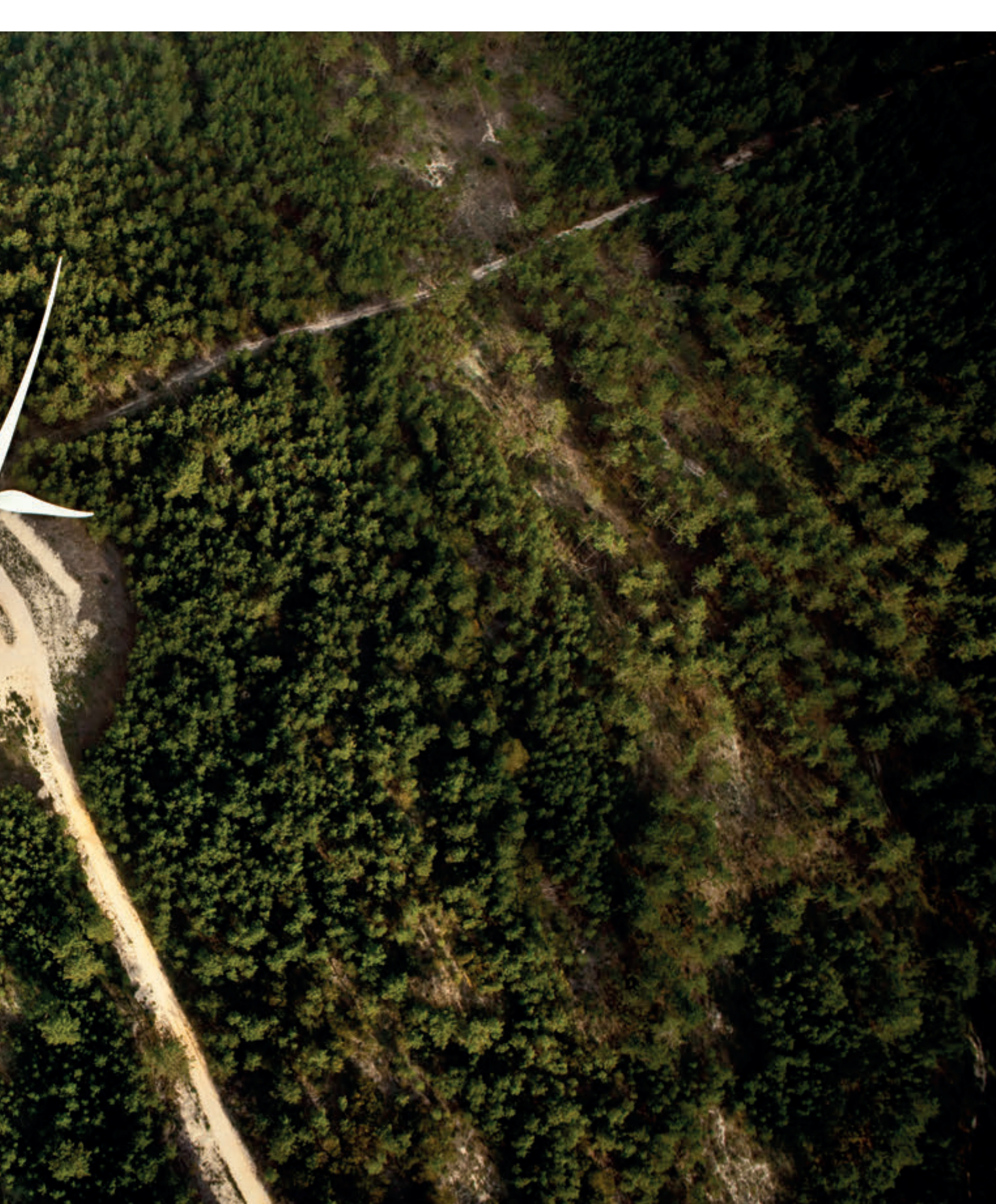
Tocha Wind Farm, Portugal