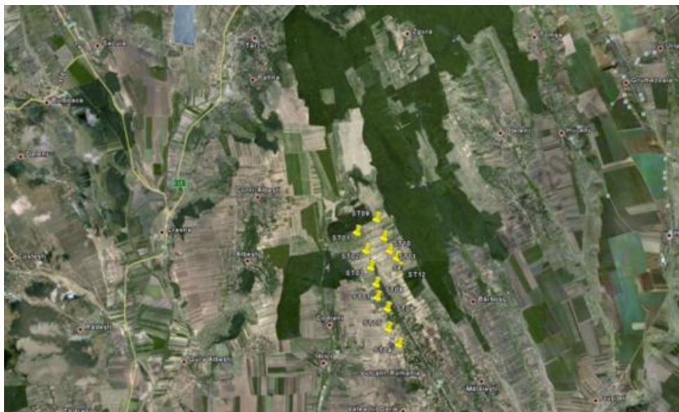
Figure 2 Vutcani Wind Farm Setting and Context

The Site covers an area of 19 ha and is on land which is privately owned. The land has limited agricultural value and is used for crop production, including wheat. Within the Site there are no forested areas or rare/sensitive plant species. Agricultural land use is not colonised other than by grasses and plants which are fast growing and tolerant to the environmental conditions. Water resources are limited, with no irrigation systems in place; however, approximately 1.5 km east of the Site is the Idrici riverbed, which flows in to the Elan (this riverbed is dry during summer months). The Site is located approximately 9 km south from Lake Manjesti.